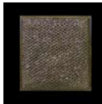
Washable Grease Filter